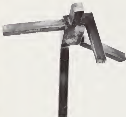
Joel Shapiro, Untitled , 1980-81